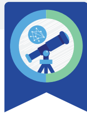
Chart Unique Path

Discover what certifications, training, and education will advance your career.